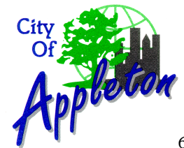
Figure 1 Water Treatment Facility Location City of Appleton, Wisconsin

Spatial Reference: Outagamie County Coordinates HARN 83